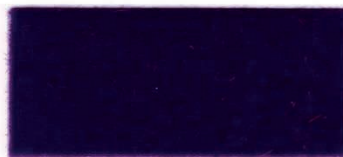
6127 violett / violet