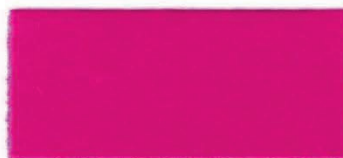
6067 pink / pink