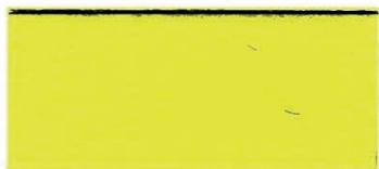
6064 gelb / yellow