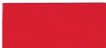
2017 signalrot / signal red