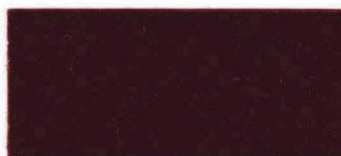
3671 cola / cola