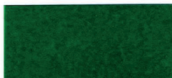
2736 grün / green