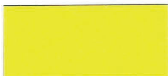
2021 zitronengelb / lemon yellow