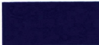
2734 sax blau / sax blue